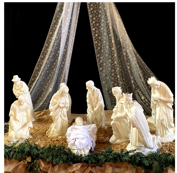
Nativity Scene in St Joseph's Church