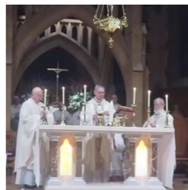
St Peter's Toorak Consecration